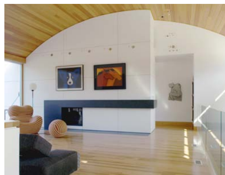
Third Place Winner ■ Contemporary Interior Design D & JL Residence