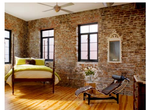
Third Place Winner ■ Historic Residential Renovation Soulard Loft Apartment